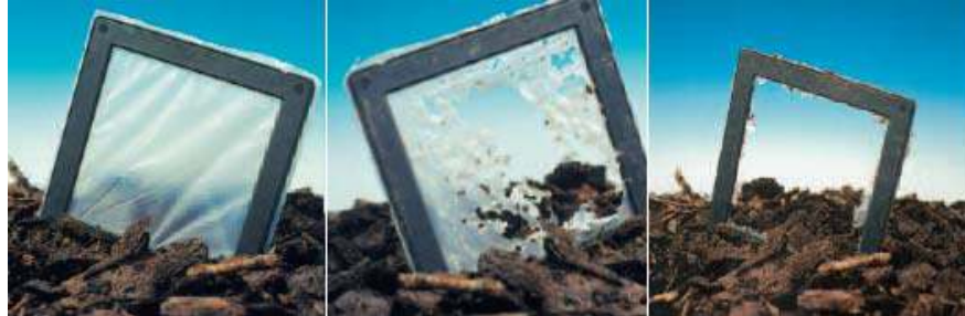
Figure #3, shows prior to insertion into compost pile, after three weeks in compost pile and after six weeks in compost pile. Less than 10% of the original weight of the film is remaining after six weeks in compost pile [11].