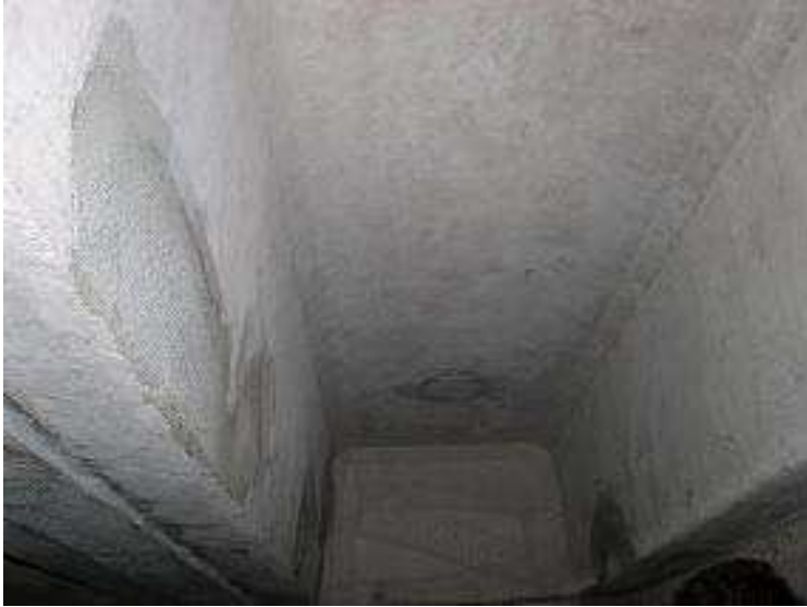
Figure 3.: Reprofiling concrete surface