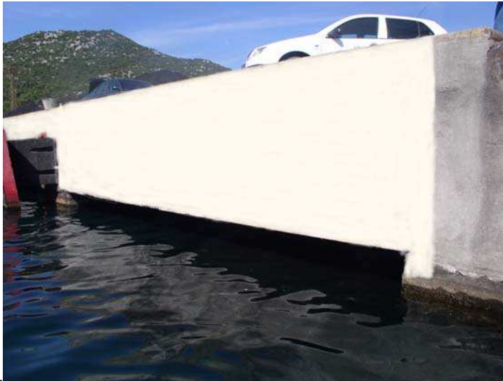
Figure 4.: MCI coating on the concrete surface