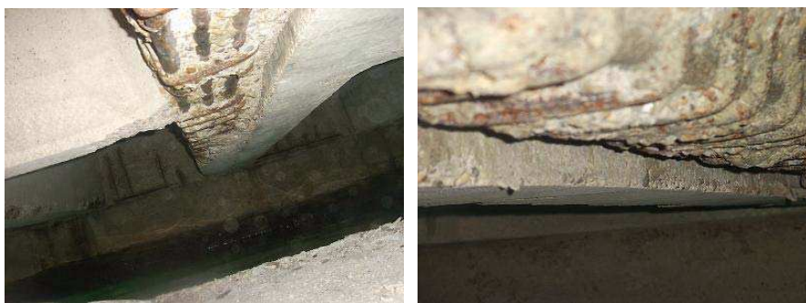
Figure 2.: Impregnation concrete surface

Impregnation of the entire concrete surface was with the water solution (1:4) of the corrosion inhibitor MCI – in powder. Application was with the brush or roller in 2 layer of the total yield cca 25 m 2 /kg.