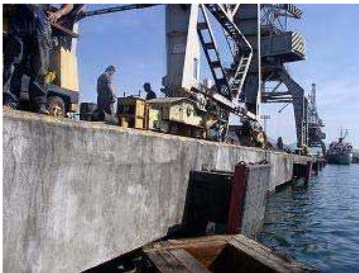
Figure 1: The module No. 3 in port Ploče

The works were carried out by the company ŠKILJO-GRADNJA, Zagvozd, according to the restoration project elaborated by the company GEOKON, Zagreb. The quality of the used materials and of performed works has tested and controlled IGH-Regional centre, Split.