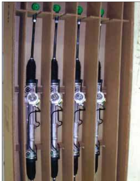
Automotive components packaged in corrugated Cortec® CorrTainer ®.